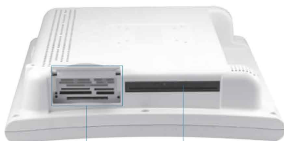
Smart Card Reader (Optional)